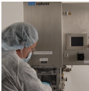
Blister forming and sealing