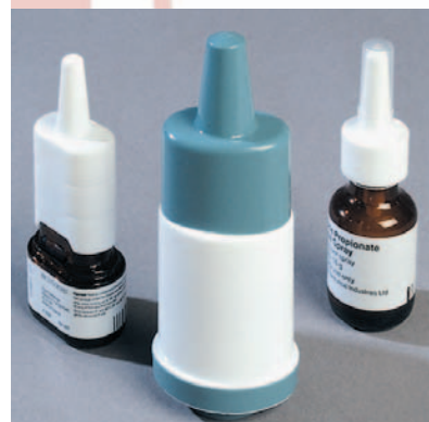
Unique double blind masking devices for pMDIs and nasal sprays