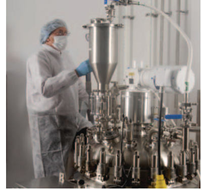
Exemplar's 250L pressure vessel

Exemplar merges product development activities with the ability to produce clinical and commercial products in a seamless, cost effective manner. Dedicated filling lines, equipment and space are available and Exemplar will build to suit the client. Capabilities include the filling of: