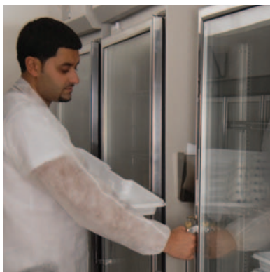
ICH stability room