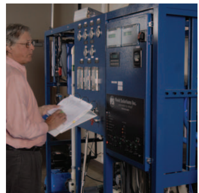
USP water system