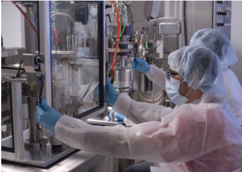
Exemplar's pMDI filling suite

The ability to move development stage products into First in Man clinical studies is now a key step in accelerating the development process. To better serve these client needs, Exemplar provides state of the art cGMP compliant, Class 100,000 manufacturing suites for pMDIs, DPIs, nasal and buccal sprays in support of Phase I through Phase IV activities. All processes are carried out in controlled environments.